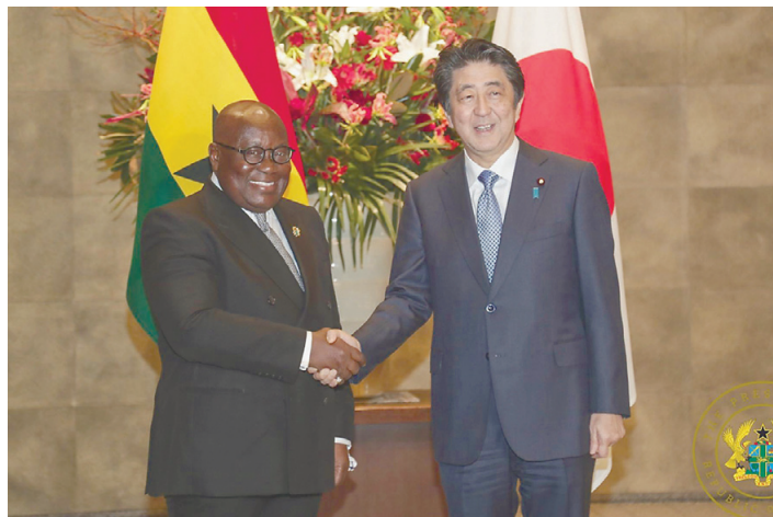
President Nana Addo Dankwa Akufo-Addo and Prime Minister Shinzo Abe meet in Tokyo on Dec. 11.

This content was compiled in collaboration with the embassy. The views expressed here do not necessarily reflect those of the newspaper.