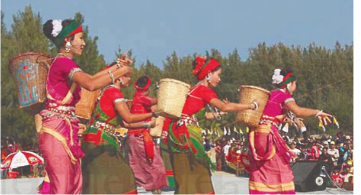
Local women dance at the Boisabi Utsab, a festival in Bangladesh.

Pakistani occupation forces committed one of the worst genocides indiscriminately on March 25, 1971, in an attempt to silence the Bangalee nation forever. Mass killings during the liberation war are a black chapter not only in the history of Bangladesh, but also in the history of world humanity. In August 2017, the national