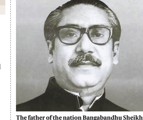
The father of the nation Bangabandhu Sheikh Muiibur Rahman

On this historic day, I recall with profound respect the architect of our independence, father of the nation Bangabandhu Sheikh Mujibur Rahman. I pay my deep homage to the martyrs and valiant sons of the soil, who made the supreme sacrifice in the war of liberation. I also recall with deep reverence our four national leaders, valiant