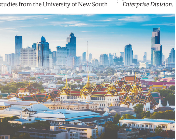
The Grand Palace in Bangkok at sunrise.