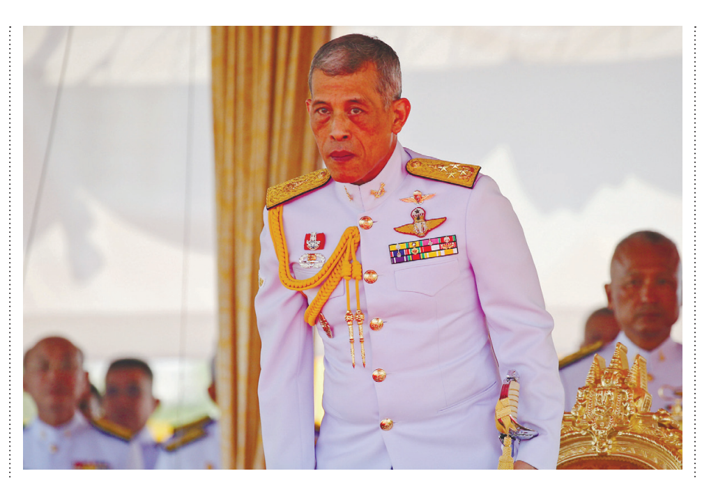
King Maha Vajiralongkorn arrives for the annual Royal Ploughing Ceremony in central Bangkok on May 14, 2018.

Following the ceremony, the king will travel in a procession around Bangkok.