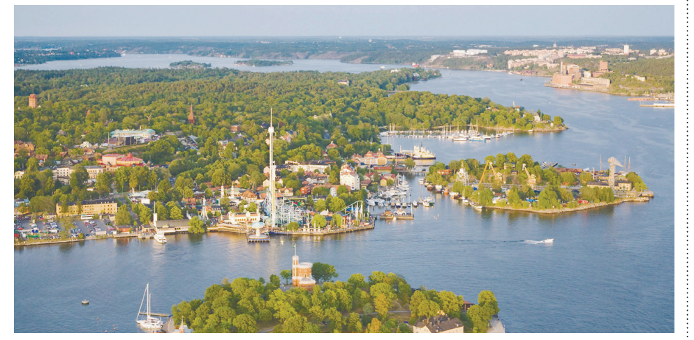
Kastellholmen, an island at the center of Stockholm's harbor.

The Swedish and Japanese share many friendship. Looking forward, a new generation of Japanese and Swedes hold the torch. young Swedes. Some of them are currently