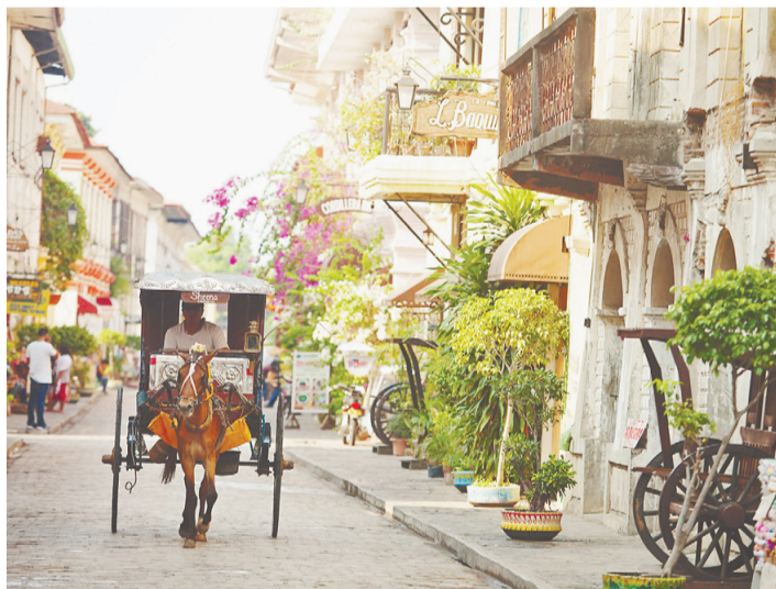
The city of Vigan in the island of Luzon is a Spanish colonial town from the 16th century. THE DEPARTMENT OF TOURISM OF THE PHILIPPINES

This content was compiled in collaboration with the embassy. The views expressed here do not necessarily reflect those of the newspaper.