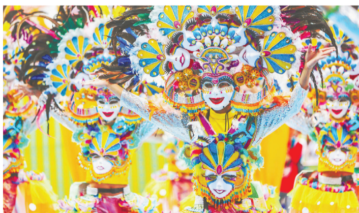
MassKara Festival is a festival held annually in October in Bacolod, Visayas. THE DEPARTMENT OF TOURISM OF THE PHILIPPINES