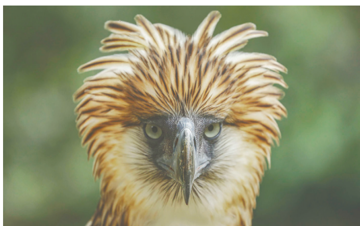
A Philippine eagle, an endangered species, from Davao in the southern island of Mindanao.

Congratulations on the 121st Anniversary of the Independence of the Republic of the Philippines