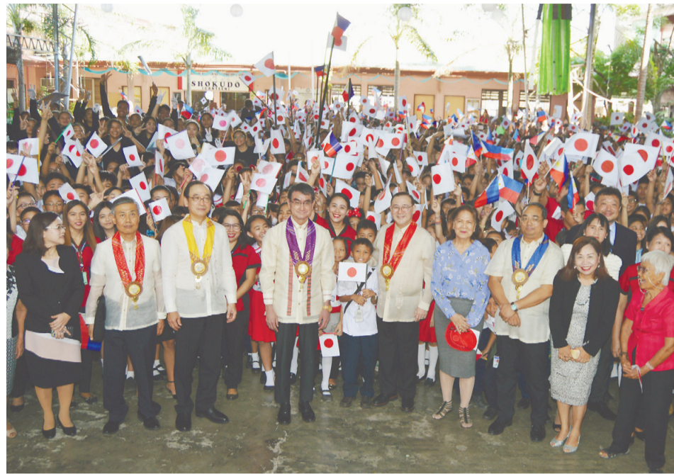
Foreign Minister Taro Kono (forth from left) and Foreign Secretary Teodoro Locsin Jr. (fifth from left) at a Japanese school in Davao on Feb. 10.

As a friend closer than a brother, Japan holds a special place in the hearts and minds of Filipinos. Today, the Philippines sees Japan as one of its most trusted partners in the world, and this relationship of trust pervades all undertakings of our