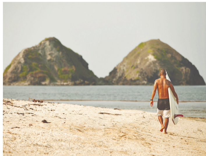
The Blue Lagoon beach in the Ilocos Norte province of Luzon Island.