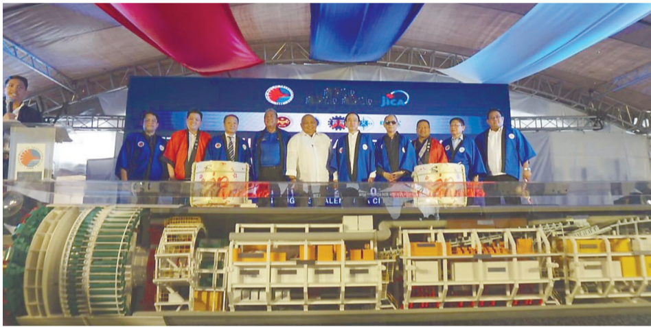
Officials of Japan and the Philippines at the groundbreaking ceremony of the Metro Manila Subway System in Barangay Ugong in February.

Mabuhay tayong lahat! Long live everyone!