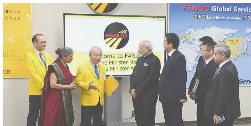
Prime Minister Narendra Modi and Prime Minister Shinzo Abe at industrial robot manufacturer Fanuc Corp.'s factory in Yamanashi Prefecture on Oct. 28.