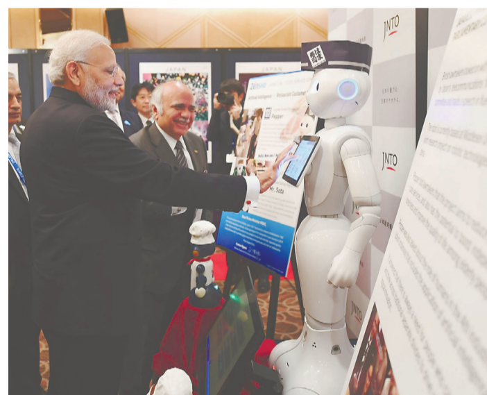
Prime Minister Narendra Modi interacts with humanoid robot Pepper at a tourism promotion venue of the Japan National Tourism Organization in Tokyo on Oct. 29.