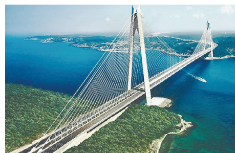
Osman Gazi Bridge, constructed in collaboration with Japanese companies, is one of the longest suspension bridges in the world.

Keidanren. Likewise, finalizing the ongoing negotiations on an economic partnership agreement will be high on the agenda of the bilateral discussions.