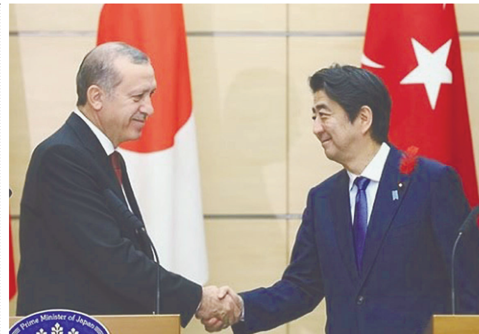
President Recep Tayyip Erdogan and Prime Minister Shinzo Abe shake hands at their meeting in October 2015 during the Turkish president's last visit to Japan.

Japan is one of Turkey's most important trade and investment partners in East Asia. Our bilateral trade volume reached approximately $4.5 billion in 2018, while Japanese investments in Turkey amount to $2.7 billion. Japanese construction companies have invested in infrastructure mega-projects in Turkey such as the Marmaray Tunnel and the Osman Gazi Bridge. Moreover, despite the considerable geographical distance between our countries, the number of Japanese tourists visiting Turkey surpassed 80,000 last year, marking an annual