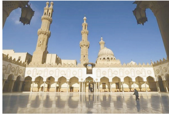
Al-Azhar Mosque in Cairo is known for its beautiful minarets and its historic university.