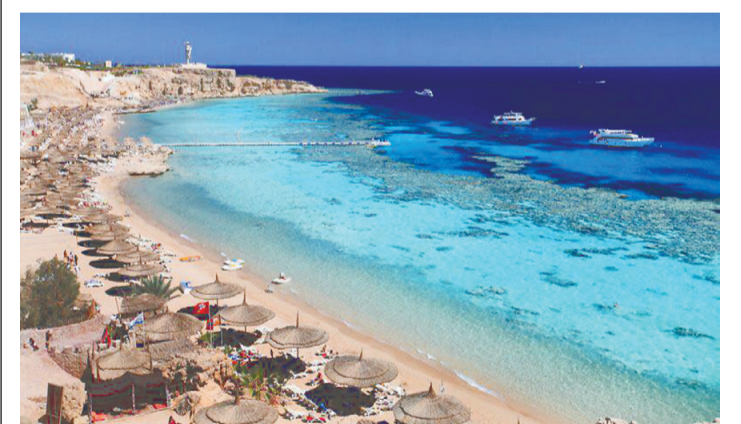
A beach of Sharm El-Sheikh, a Red Sea resort on the southern tip of the Sinai Peninsula.

Congratulations to the People of the Arab Republic of Egypt on the Occasion of the 67th Anniversary of Their National Day