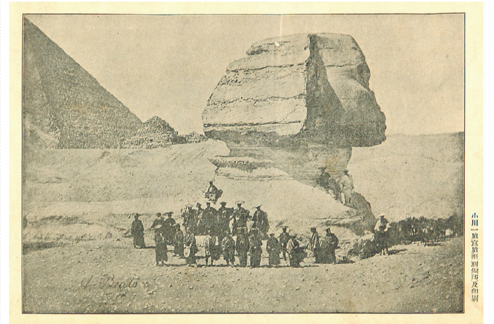
Some members of the second Japanese mission to Europe on their way to France, standing near the Sphinx in a photo taken by Antonio Beato in 1864. NATIONAL DIET LIBRARY