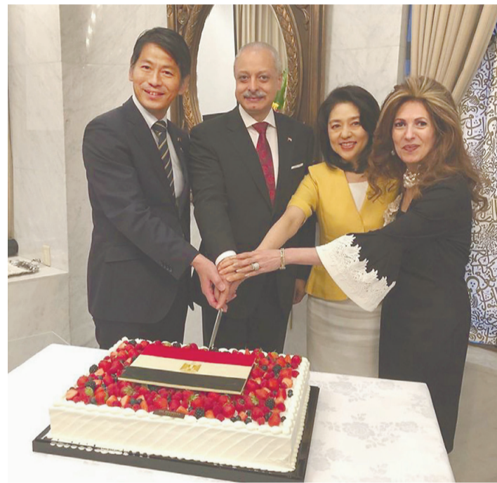
(From left) Parliamentary Vice Foreign Minister Kenji Yamada, Ambassador of Egypt Ayman Aly Kamel, Kaori Kono, wife of Foreign Minister Taro Kono, and Ghada Youssef, wife of Kamel, cut a cake at a reception for celebrating the National Day of Egypt.