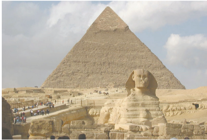
The Great Pyramid of Giza and Great Sphinx of Giza on the west bank of the Nile. EGYPTIAN TOURISM AUTHORITY

With an increasing exchange of visits of high-ranking officials, we are more determined today to further enhance our bilateral cooperation in various fields and keep up this momentum for a more prosperous and long-lasting partnership between Egypt and Japan.