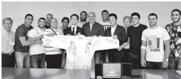
Egypt's National team camped for training in Tenri

to the People of the Arab Republic of Egypt on the Occasion of the 67th Anniversary of Their National Day