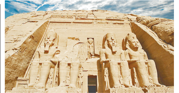
The front of the main temple of Abu Simbel, a monument to Pharaoh Ramses II.

Nihonbashi 1-chome Bldg., 4-1, Nihonbashi 1-chome, Chuo-ku, Tokyo 103-8247, Japan