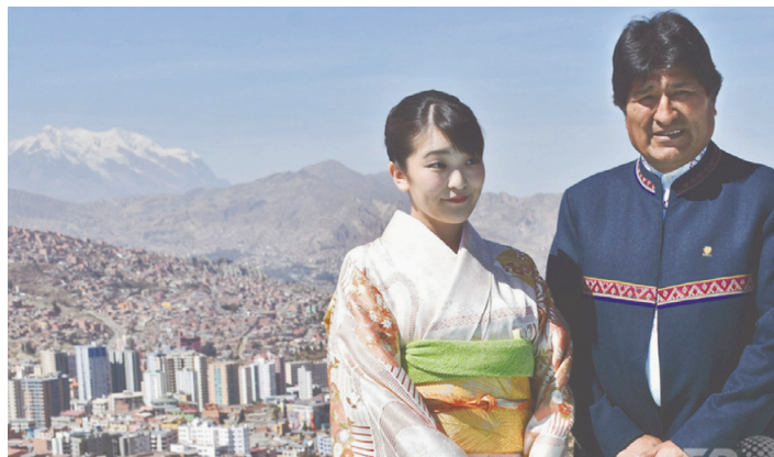
Princess Mako with President Evo Morales at Casa Grande del Pueblo in La Paz, during her visit to Bolivia on July 15.

This content was compiled in collaboration with the embassy. The views expressed here do not necessarily reflect those of the newspaper.