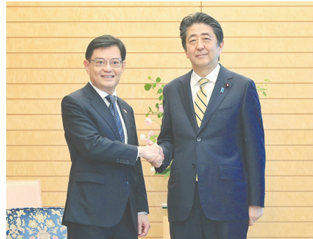
Deputy Prime Minister Heng Swee Keat and Prime Minister Shinzo Abe in Tokyo in May

Our economic ties are robust. We are both members of the Comprehensive and Progressive Agreement for Trans-Pacific Partnership and working actively to conclude the Regional Comprehensive Economic Partnership. In 2002, the Japan-Singapore Economic