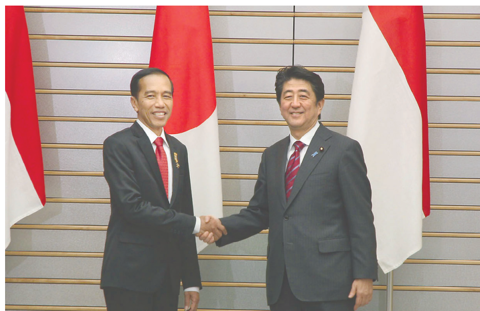
Indonesian President Joko Widodo and Japanese Prime Minister Shinzo Abe shake hands at their summit meeting in Tokyo on March 23, 2015.

As expressed by President Joko Widodo in his first re-election speech in July, the president is gearing the country up for big changes ahead. First among the preparations is the continuation of developing large and small infrastructure projects. In the past four years, toll roads as well as those in villages and remote areas have been developed. Additionally, by the end of this year, more roads are expected to be completed. Such developments are needed as the basic requirement to narrow development