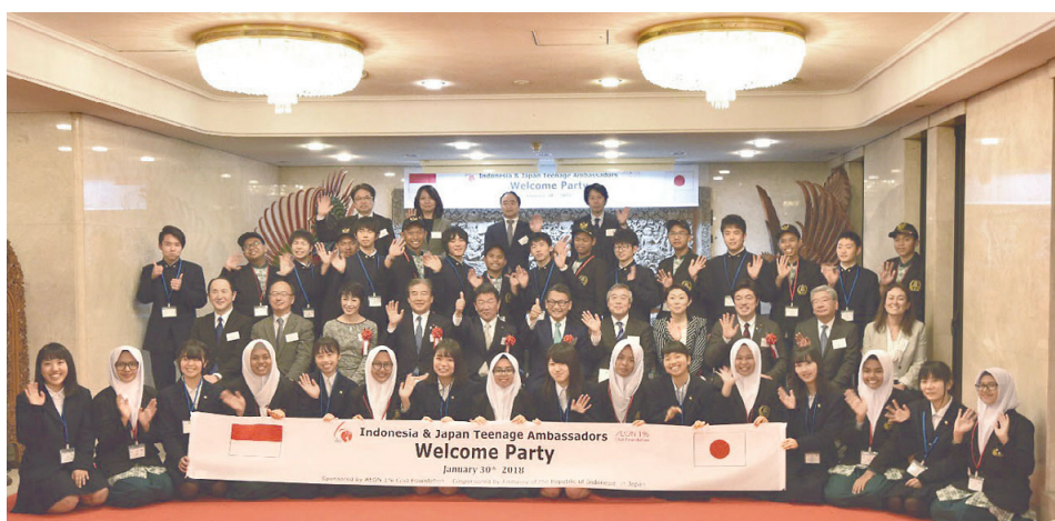
Indonesian and Japanese high school students who participated in the Japan-Indonesia Teenage Ambassadors program pose for a photo in Tokyo in January 2018.

This content was compiled in collaboration with the embassy. The views expressed here do not necessarily reflect those of the newspaper.