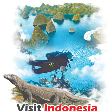
Indonesia boasts beautiful seas and rich biodiversity. THE MINISTRY OF TOURISM OF INDONESIA

Congratulations on the 74th Anniversary of Independence of the Republic of Indonesia August 17, 2019