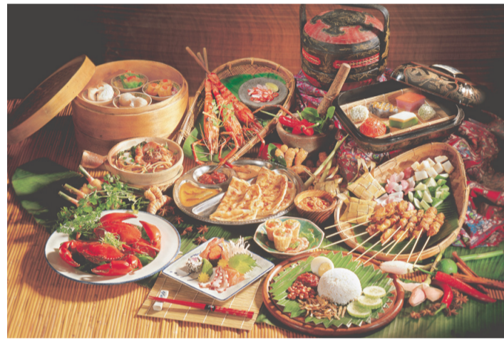
As a multiethnic country, Malaysia offers various flavors in its cuisine including Chinese, Indian and many others. TOURISM MALAYSIA