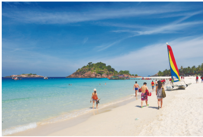
Redang Island off the east coast of the Malay Peninsula is known for its magnificent coral reefs and crystal clear waters.

On this auspicious occasion, I would like to extend my warmest greetings to all the readers of The Japan Times, and wish all Malaysians and friends of Malaysia Selamat Hari Kebangsaan (Happy National Day).