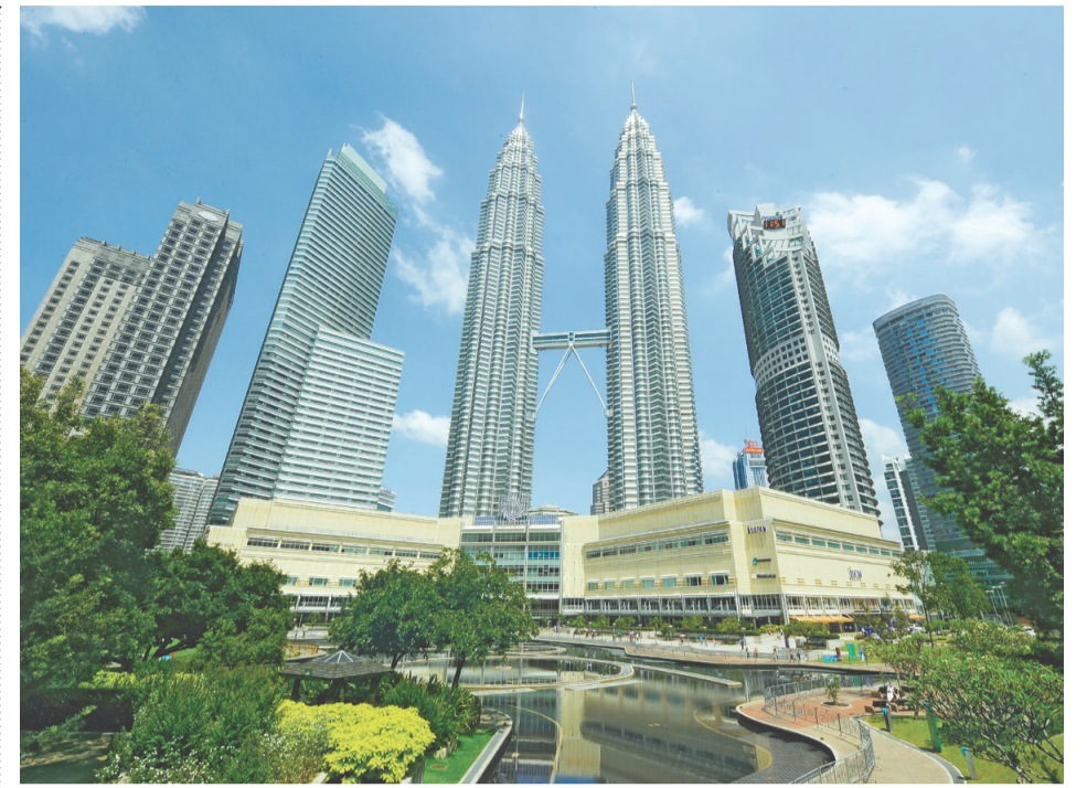
The Petronas Twin Towers in Kuala Lumpur is a Malaysian landmark. Completed in 1998, the 452-meter-high buildings are the tallest twin towers in the world.

Being strategically situated in the heart of the Association of Southeast Asian Nations, or ASEAN, region, Malaysia has much to offer to multinational corporations and investors. This includes access to a steady stream of talent, a modern business ecosystem, world-class infrastructure and connectivity, as well as competitive cost advantages and incentive packages. Multinational corporations can utilize all these advantages, using Malaysia as their base or platform to conduct their regional