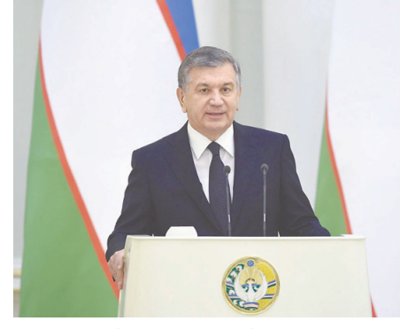
President of the Republic of Uzbekistan Shavkat Mirzivovev EMBASSY OF UZBEKISTAN

The government of Uzbekistan gives great priority to the implementation of economic reforms, including further liberalization of monetary and financial policies, improving the investment climate, and promoting the development of small and midsized businesses. In this regard, the