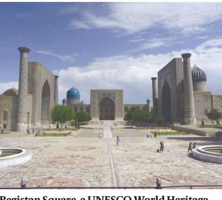
Registan Square, a UNESCO World Heritage site, in Samarkand

regions of Osaka, Nagoya, Fukuoka, Sapporo and Hiroshima directly to Samarkand by Uzbekistan Airways.