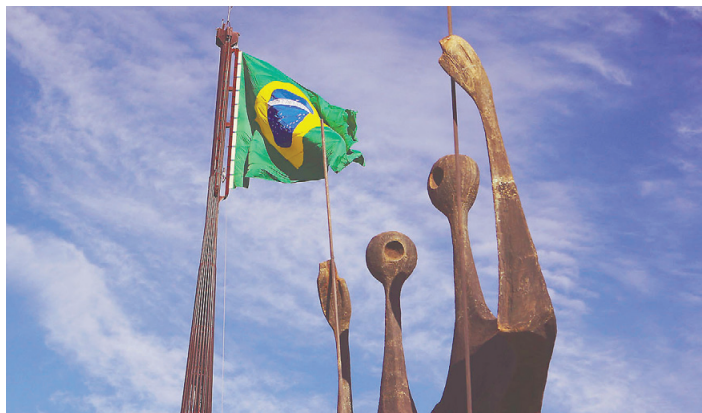
A Brazilian flag is raised beside a sculpture at Three Power Square in Brasilia. The square, surrounded by the three branches of government, was designed by Lucio Costa and Oscar Niemeyer.

This content was compiled in collaboration with the embassy. The views expressed here do not necessarily reflect those of the newspaper.