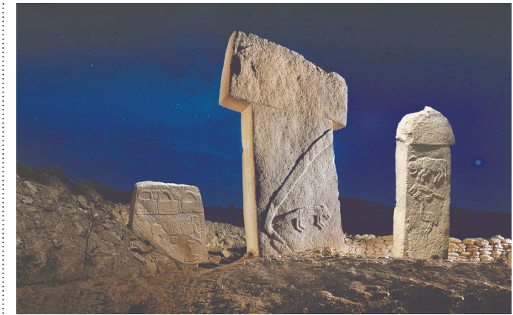
Far left: President Recep Tayyip Erdogan and Prime Minister Shinzo Abe during the G20 summit held in Osaka on June 28. Left: Gobekli Tepe, an archaeological site in southeastern Turkey, became a UNESCO World Heritage site in 2018.

mainly from Topkapi Palace in Istanbul, were displayed during this exhibition. More than 200,000 visitors found the opportunity to enjoy some of the most precious and symbolically important items of the Topkapi Palace Museum, including the throne of Ottoman Sultan Mahmud II, Japanese vases as well as presents from the emperor of