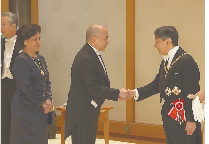
King Norodom Sihamoni (center) and Emperor Naruhito at the Imperial Palace in Tokyo on Oct. 22