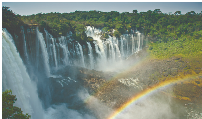
Located in Malanje province, the Kalandula Falls are among Africa's largest waterfalls by volume. EMBASSY OF ANGOLA

land since the dawn of the colonial liberation struggle. Their untold sacrifices led to the birth of an independent Angola on Nov. 11, 1975, following five centuries of colonization.