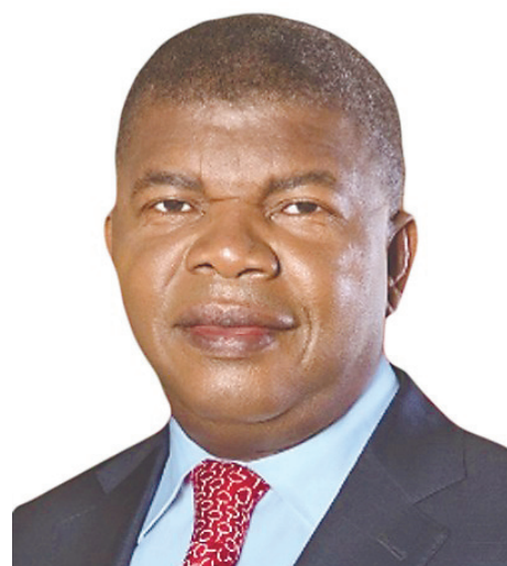
President of the Republic of Angola Joao Manuel Goncalves Lourenco

Today, as we celebrate the independence of Angola, we pay tribute and deep respect to all those who heroically sacrificed their lives for the independence of our home-