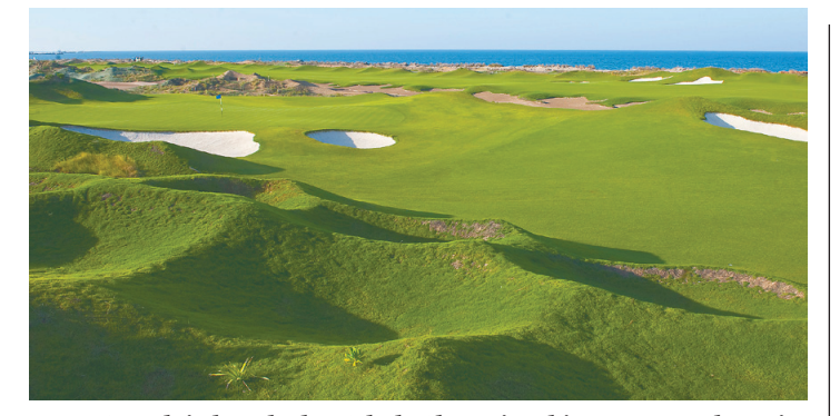
At 7,342 yards in length, the 18-hole Championship Course at Al Mouj Golf is Oman's first links style course offering amateurs and professionals a challenging, yet rewarding, game of golf.