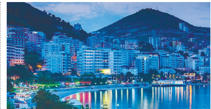
Saranda, a coastal town that borders the blue waters of the Mediterranean sea NATIONAL AGENCY OF TOURISM

This content was compiled in collaboration with the embassy. The views expressed here do not necessarily reflect those of the newspaper.