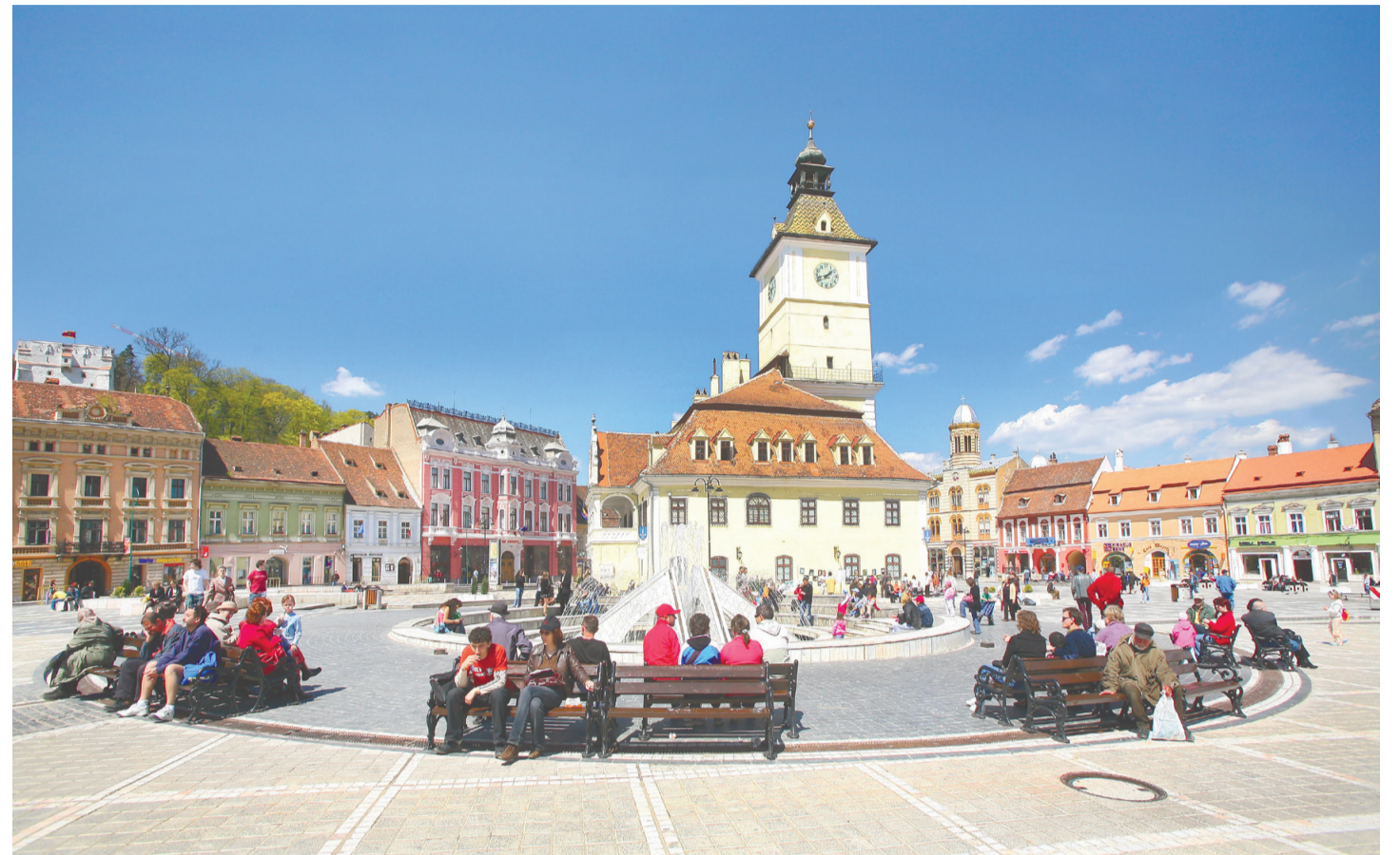
The Council Square in the historic center of Brasov, Romania, is surrounded by 18th and 19th-century townhouses. The former Council House (center) was initially built in 1420.

Together with the EPA, the strategic part-