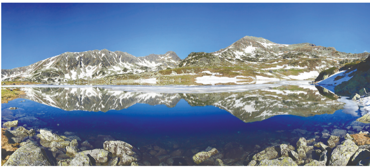
The Retezat Mountains are one of the highest massifs in Romania. EMBASSY OF ROMANIA

This content was compiled in collaboration with the embassy. The views expressed here do not necessarily reflect those of the newspaper.