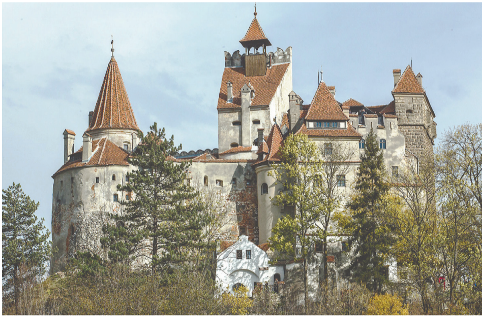
The medieval Bran Castle is a famous tourist attraction that is also known as Dracula's Castle.

To conclude, I would like to express my satisfaction for the strong and dynamic ties between our countries and our commitment to build, together with our Japanese partners, toward a new level of cooperation and partnership, based on the fundamental values of democracy and rule of law that we share.