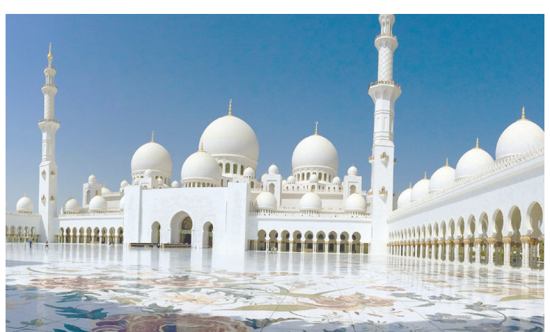
Sheikh Zaved Grand Mosque EMBASSY OF THE UAE

UAE and Japan is entering now a new phase