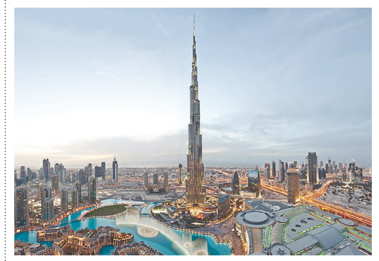
Burj Khalifa EMBASSY OF THE UAE

This content was compiled in collaboration with the embassy. The views expressed here do not necessarily reflect those of the newspaper.