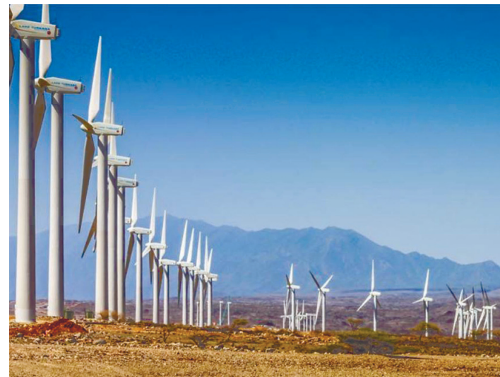
The 310-megawatt Lake Turkana Wind Power project is the largest wind farm in Africa.

This content was compiled in collaboration with the embassy. The views expressed here do not necessarily reflect those of the newspaper.