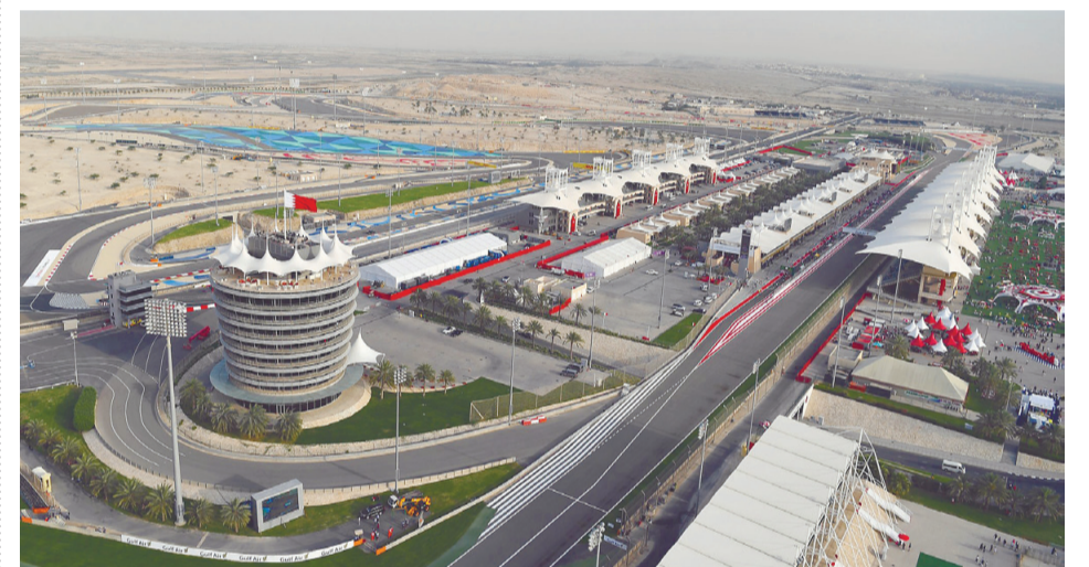
Top: Bahrain Bay. Above: Bahrain will host the Formula One race at the Bahrain International Circuit on March 22, 2020.