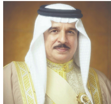
King Hamad bin Isa Al Khalifa

With a cosmopolitan capital city, an attractive liberal lifestyle and a rich history and culture, Bahrain provides a wide variety of tourist attractions. The booming tourism sector attracted 12 million visitors annually and plays an increasingly important role in Bahrain's economy, as it has doubled its contribution to almost 7 percent of our GDP. The building of over 100 new five- and four-star hotels in the past five years is supported by Bahrain's significant infrastructure project developments,