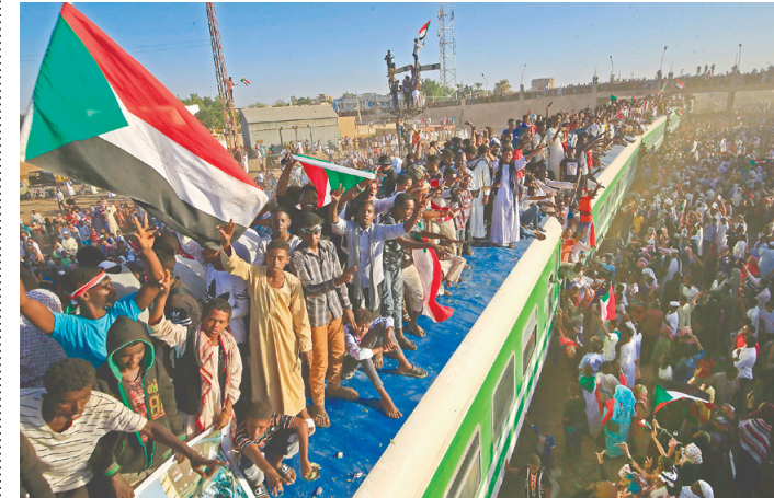
People celebrate the first anniversary of the uprising that led to topple President Omar al-Bashir, in Atbara in River Nile state on Dec. 19.

This content was compiled in collaboration with the embassy. The views expressed here do not necessarily reflect those of the newspaper.