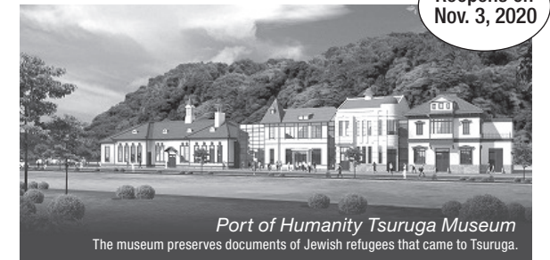
Port of Humanity Tsuruga Museum The museum preserves documents of Jewish refugees that came to Tsuruga.

http://www.tmo-tsuruga.com/kk-museum/index_e.html