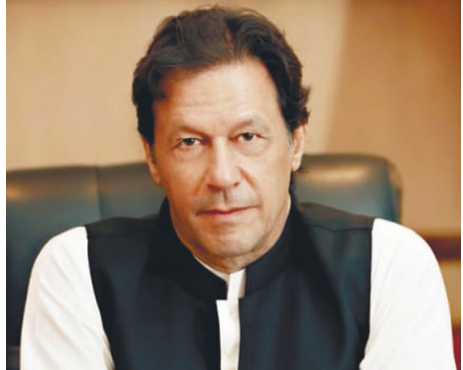
Prime Minister of Pakistan Imran Khan

As we celebrate the 68th anniversary of the establishment of diplomatic relations