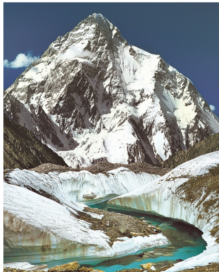
K2 in the Gilgit-Baltistan region of northern Pakistan is the second-tallest mountain in the world.

Please let me conclude my message by once again offering my most sincere congratulations on the occasion of Pakistan Day. We look forward to the further strengthening of friendship and partnerships between our two nations.