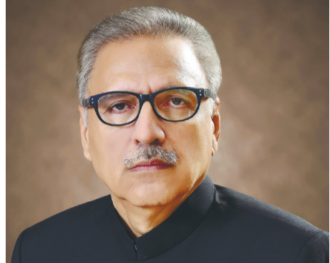
President of Pakistan Dr. Arif Alvi

The active and vibrant Pakistani diaspora in Japan, now numbering almost