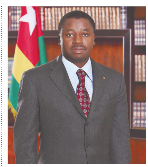
Togo President H.E. Faure Essozimna Gnassingbe

Not only are we able to reflect on our common past, but above all, develop new perspectives and strategies to consolidate cooperation between Japan and Togo. I would therefore like to congratulate the Japanese government for the organization of TICAD 7 that has enabled Japan and its African partners, including Togo,