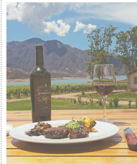
Mendoza, located in the Cuyo region, is considered the heart of Argentina's wine culture.

the momentum we have gathered to date. To strengthen our ties even further, we must explore opportunities in a post-coronavirus world, as new norms may emerge. At the 25th Argentina-Japan Joint Business Conference held in Buenos Aires in May 2018, our two nations discussed the significance of cooperation in artificial intelligence, the "internet of things" and other innovative sectors. As chairman, I will continue to foster an even stronger friendship and better economic relations between our two nations.