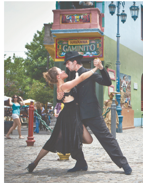
Tango dancers in La Boca, a well-known neighborhood of Buenos Aires

During this year of unexpected challenges, we are grateful to the Japanese authorities and to the Japanese civil society, in particular to our friends of the Nippon-Argentina Association for their help in improving the situation of the Argentine nationals stranded in Japan as a consequence of worldwide travel and flight restrictions. Within the COVID-19 pandemic, which continues to test the resili-