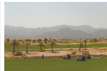
Ayla Golf Club is Jordan's first all-grass 18-hole championship golf course.

caused by this pandemic has highlighted how interdependent we are on one another in ensuring a better future and world for all. Our sincere sympathies go out to all those who lost loved ones, and to all fellow human beings who have found themselves bearing the brunt of it. Our deepest gratitude goes out to all the brave medical and all other workers who risk their lives to save ours.