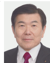
Japan over the past year. In August, Minister of Economy and Finance Adriano Maleiane

It is my tremendous honor and privilege to extend my heartfelt greetings to the people of the Republic of Mozambique on the occasion of the 45th anniversary of its independence. In January, President Filipe Jacinto Nyusi was inaugurated for his second term. This will undoubtedly ensure further prosperity and stability for Mozambique and its