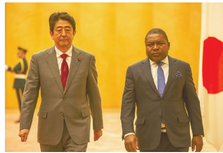
Prime Minister Shinzo Abe and President Filipe Jacinto Nyusi in Tokyo in March 2017

At the bilateral level, Japan is implementing several projects in several sectors of our economy, namely agriculture, energy, health, human resources development and infrastructure. On the economic front, significant investments have been made in strategic