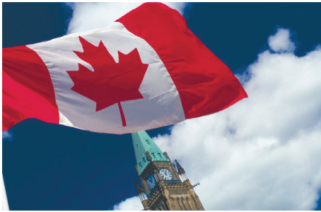
The Canadian flag in front of Parliament Hill in downtown Ottawa

Moreover, our rich people-to-people connections continue to flourish, highlighted by the cross-Canada visit that Her Imperial