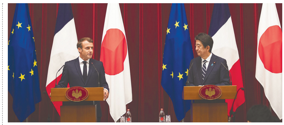
President Emmanuel Macron speaks at a news conference with Prime Minister Shinzo Abe in Tokyo on June 26, 2019.

This content was compiled in collaboration with the embassy. The views expressed here do not necessarily reflect those of the newspaper.