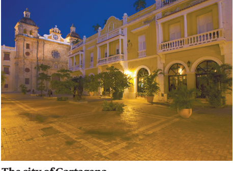
The city of Cartagena MINISTRY OF FOREIGN AFFAIRS

country has been a leader in the protection of the environment and biodiversity. Considering Colombia's high potential and the circumstance of the bilateral relationship, further tightened in recent years, as well as the significant security improvements in the country, I sincerely wish that Japan can contribute even more to the further development of Colombia.