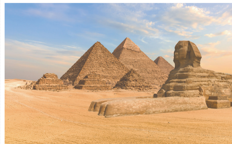
The Pyramids of Giza and the Great Sphinx of Giza