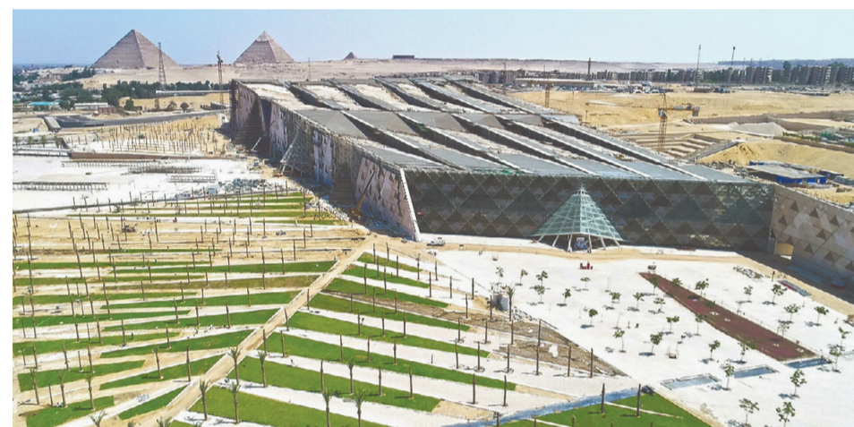
Expected to be the largest archaeological museum in the world displaying thousands of artifacts from a single civilization, the Grand Egyptian Museum has been rescheduled to open in 2021 in Giza.