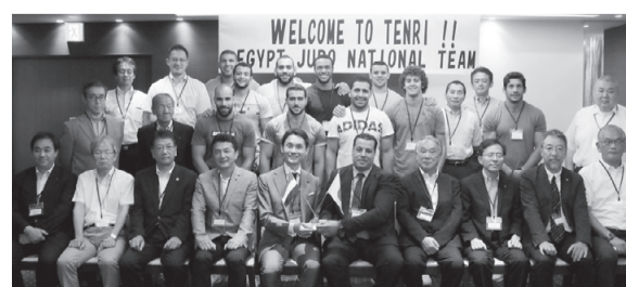
The Egyptian team's welcome reception by Tenri city and Nara prefecture

Congratulations to the People of the Arab Republic of Egypt on the Occasion of the Anniversary of Their National Day