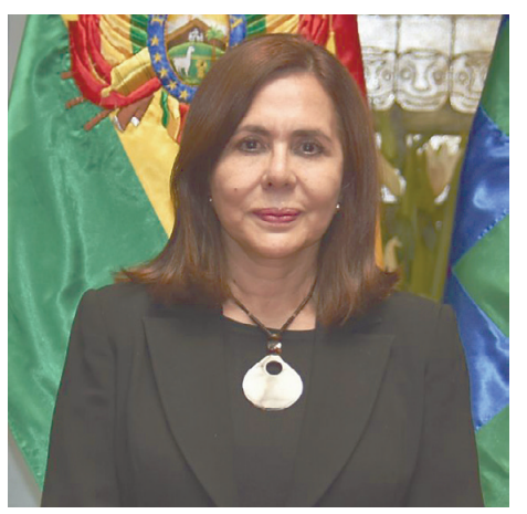
Foreign Minister Karen Longaric Rodriguez

The Ministry of Health of Bolivia has been making every effort to prevent