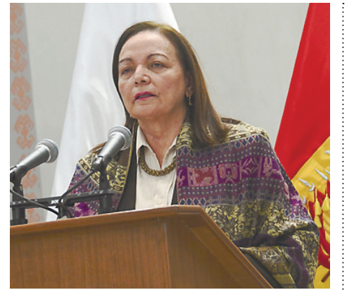
Health Minister Eidy Roca Justiniano

This content was compiled in collaboration with the embassy. The views expressed here do not necessarily reflect those of the newspaper.