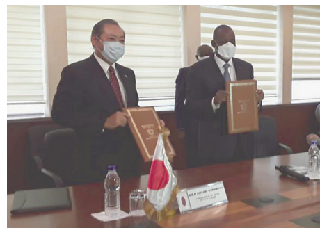
The Ambassador of Japan in Cote d'Ivoire and the Minister of Foreign Affairs of Cote d'Ivoire at a signing ceremony on July 6, 2020

In conclusion, I would like to express my sincere thanks to the following companies for their support in sponsoring my message — Marubeni Corp., Mitsubishi Corp., NS Semicon Co. and Toyota Tsusho Corp.