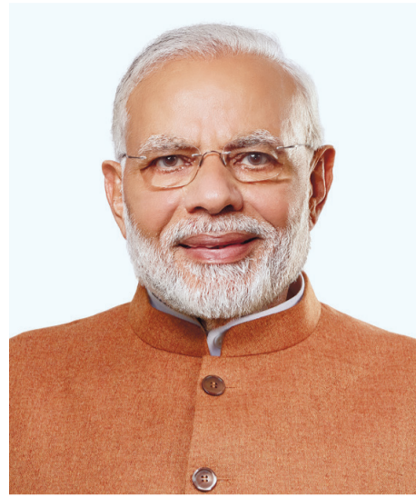
Prime Minister of India Narendra Modi

We have given the highest priority to deliver benefits to poor households, with a package of more than $300 billion. We have also put forward a vision of Atmanirbhar Bharat or Self-Reliant India. The idea of self-reliance does not mean seeking self-centered arrangements or turning the country inward. Its essential aim is to ensure India's position as a key participant in global supply chains. In the post-coronavirus world, we need a new template of globalization based on fairness, equality and humanity. What we need is a reformed multilateralism that reflects contemporary realities and can respond to present-day challenges. India and Japan have long championed