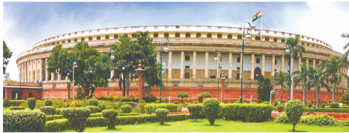
Parliament of India in New Delhi EMBASSY OF INDIA

On this auspicious occasion, the Japan-India Association, with its 117 years of history and wide-ranging network, renews its determination to work for further development of mutual understanding and friendship between Japan and India.