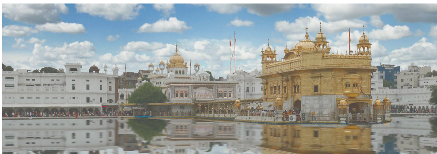
Golden Temple in Amritsar EMBASSY OF INDIA

Lastly, we at the JIBCC offer our deepest condolences and sympathy to all those affected by the coronavirus in India. At this difficult juncture, I hereby reaffirm our commitment to further strengthening our bilateral relationship and sincerely hope for India's continuing growth and prosperity in the future.