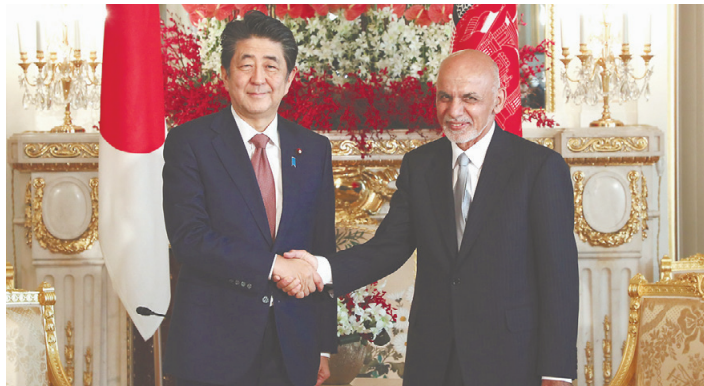
Prime Minister Shinzo Abe and President Mohammad Ashraf Ghani on Oct. 23 in Tokyo

This content was compiled in collaboration with the embassy. The views expressed here do not necessarily reflect those of the newspaper.