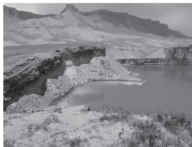
Band-e Amir Lakes

on the Anniversary of the Independence of Islamic Republic of Afghanistan