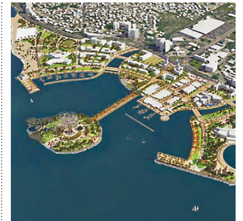
Libreville is well known for its great urban development investment opportunities.

This content was compiled in collaboration with the embassy. The views expressed here do not necessarily reflect those of the newspaper.