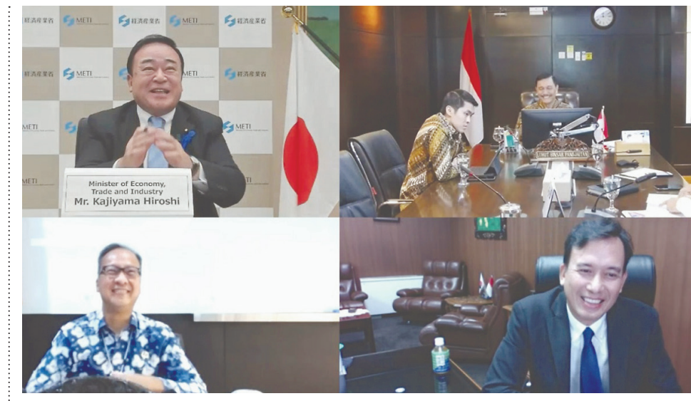
Clockwise from top left: METI Minister Hiroshi Kajiyama, coordinating Minister for Maritime Affairs and Investment Luhut Pandjaitan, Tri Purnajaya and Minister of Industry Agus Gumiwang hold a virtual consultation on July 14

This content was compiled in collaboration with the embassy. The views expressed here do not necessarily reflect those of the newspaper.