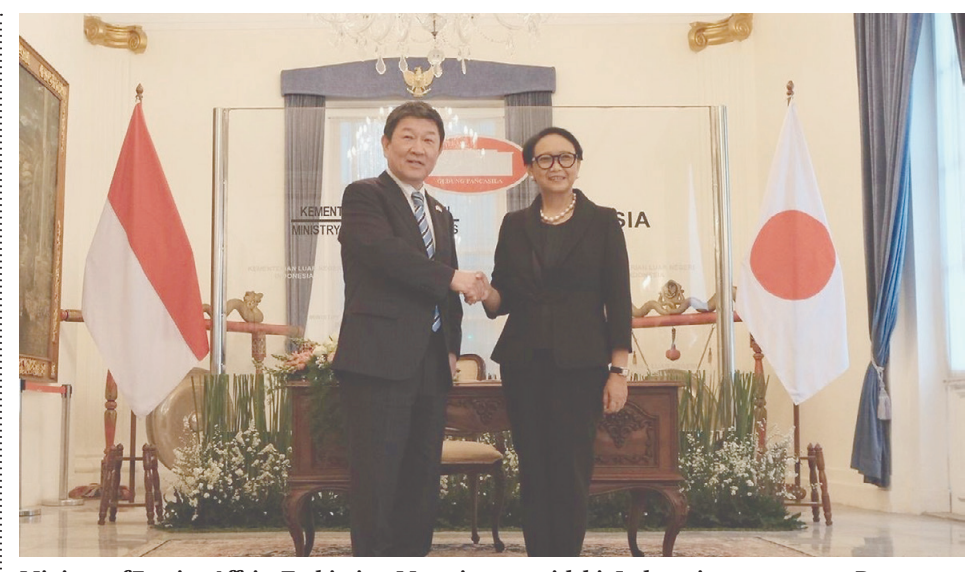
Minister of Foreign Affairs Toshimitsu Motegi meets with his Indonesian counterpart Retno Marsudi during the Japan-Indonesia Ministerial Level Strategic Dialogue in Jakarta on Jan. 10.

Apart from the economic aspect, strong collaboration in various multilateral and regional forums have been the highlight of the Indonesia-Japan relationship.