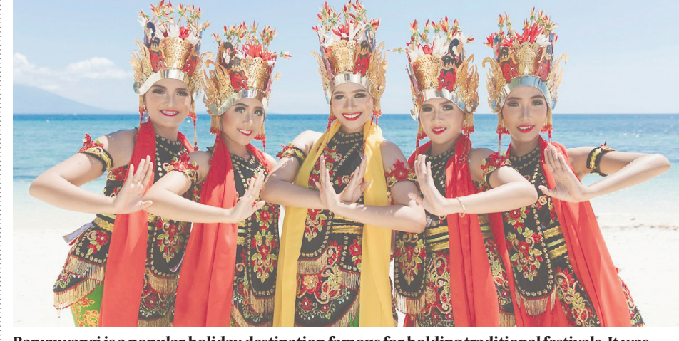
Banyuwangi is a popular holiday destination famous for holding traditional festivals. It was declared a national geological park in 2018.