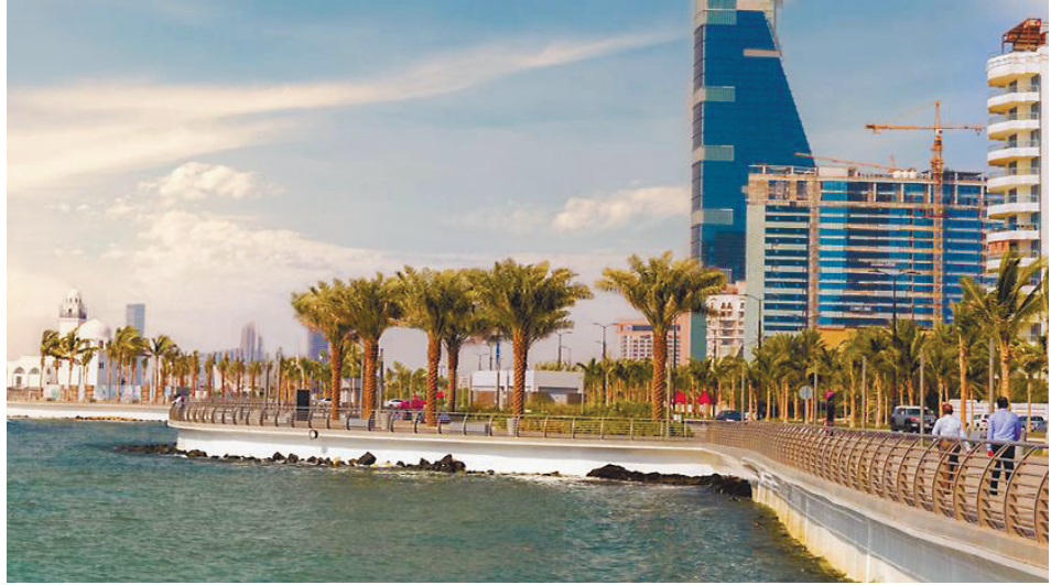
The Jeddah Waterfront is a popular Saudi Arabia recreational spot located along the Red Sea.

Last but not least, I pray for the peace and prosperity of the Kingdom of Saudi Arabia and heartily wish the king and crown prince good health and happiness.