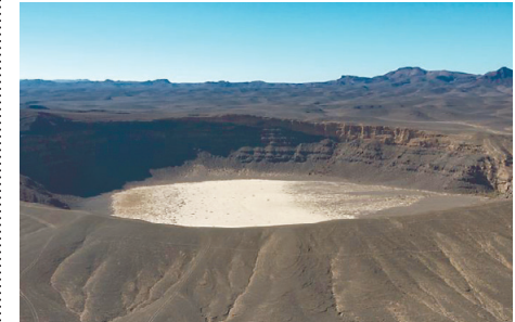
Al Wahba crater is one of Saudi Arabia's most spectacular natural wonders. EMBASSY OF SAUDI ARABIA

This content was compiled in collaboration with the embassy. The views expressed here do not necessarily reflect those of the newspaper.