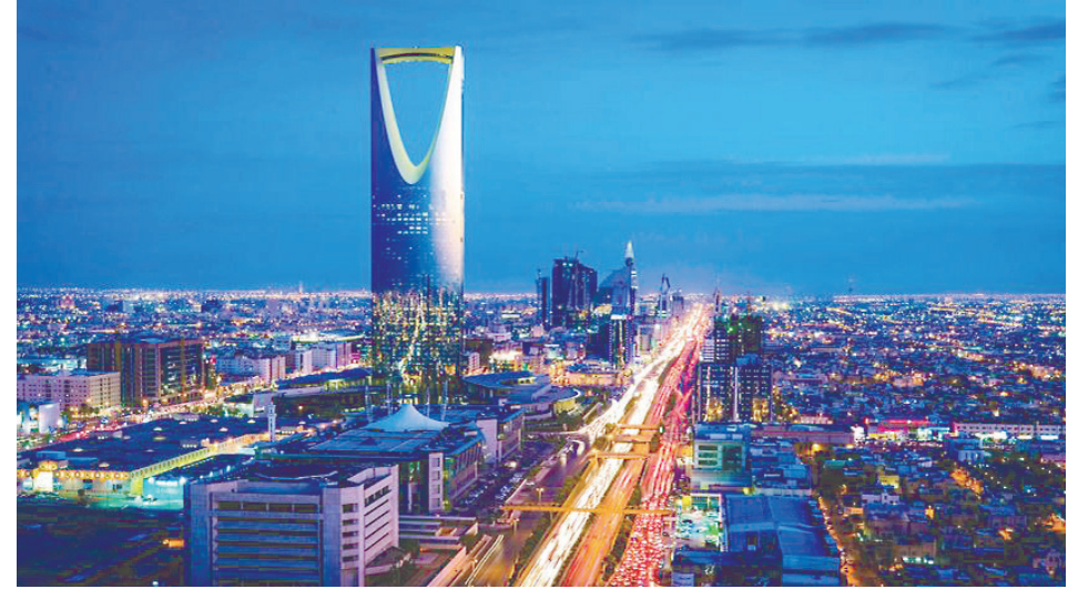
The Riyadh skyline is marked by distinctive architecture such as Kingdom Tower. EMBASSY OF SAUDI ARABIA