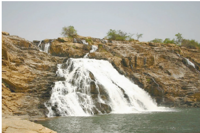
Panoramic view of the Gurara Waterfalls, one of the major tourist sites in Nigeria JEFF ATTAWAY

This content was compiled in collaboration with the embassy. The views expressed here do not necessarily reflect those of the newspaper.