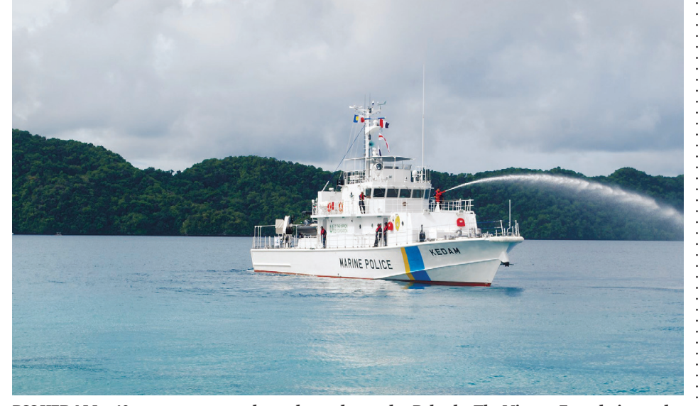
PSS KEDAM, a 40-meter-type patrol vessel, was donated to Palau by The Nippon Foundation and Sasakawa Peace Foundation together with an administrative building "Bai ra Bul" and berth "Melusch Melachel" during a handover ceremony in 2018.