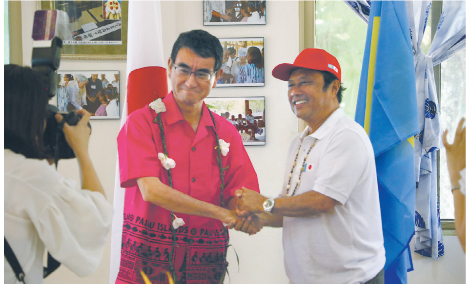
The then Minister for Foreign Affairs of Japan Taro Kono visits Palau in August 2019.