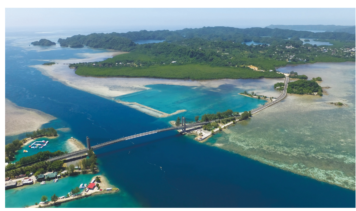
The Japan-Palau Friendship Bridge, built with Japan's official development assistance and completed in 2002, connects the islands of Koror and