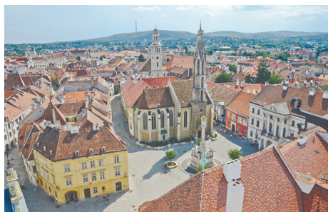
Sopron is popular with tourists because of its distinct architecture and history.

Like 1956 was for Hungary, this year has been a difficult time for all of humankind: the global coronavirus pandemic has disrupted the normal way of life and the