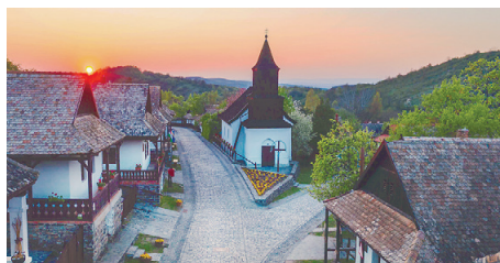
The village of Holloko is a UNESCO World Heritage site.

Although the pandemic spoiled a good number of our plans this year, I can proudly look back on a record of fruitful cooperation in 2019. Last year was very special in our bilateral relationship when we celebrated the 150th anniversary of