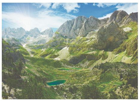
Theth, a national park in northern Albania centered on the Albanian Alps, is famous for its natural beauty.