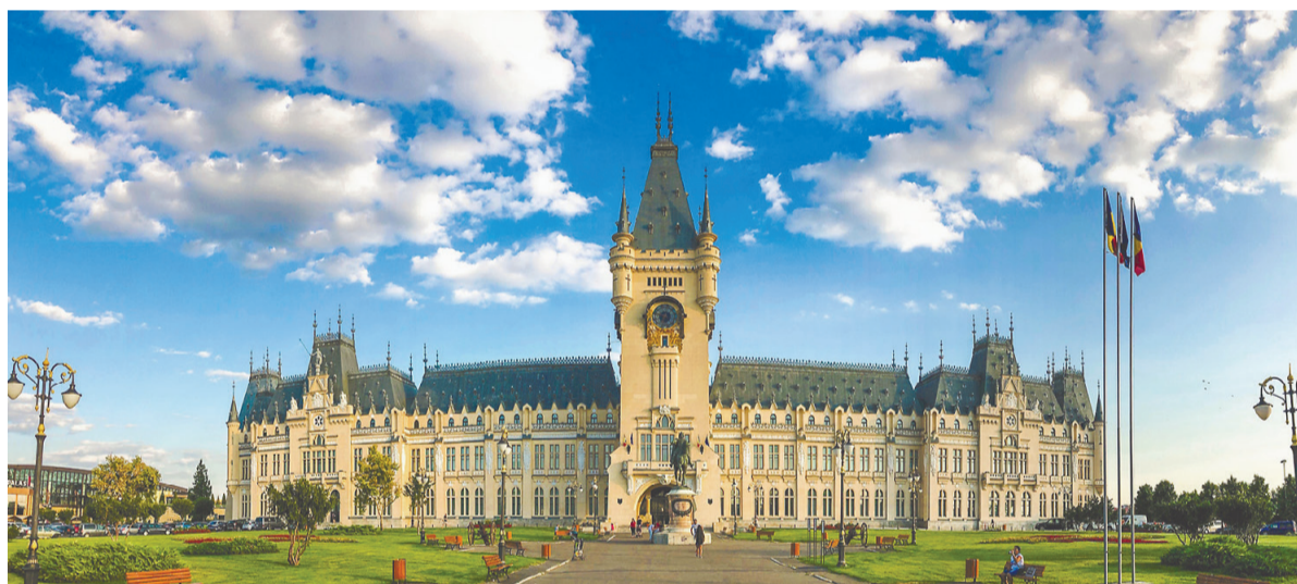
The Palace of Culture in Iasi is one of the city's most impressive attractions.