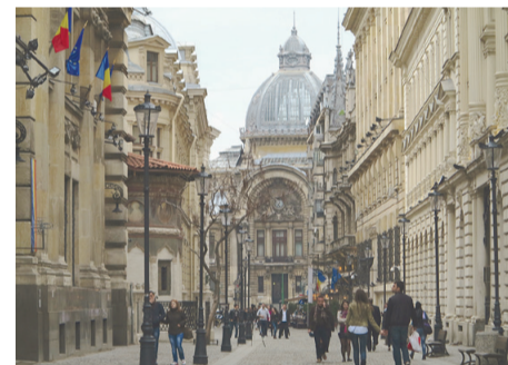
Stavropoleos Street in the Old Town district of Bucharest