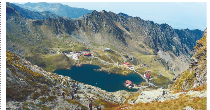
Balea Lake in the Fagaras Mountains EMBASSY OF ROMANIA

Next year will also have a special significance for our bilateral ties, as we will commemorate 100 years of diplomatic relations. It is a good moment to take stock of our past accomplishments, which made possible the strong ties that we enjoy today and together build toward a new level of cooperation and strategic partnership, based on the basic values of democracy and the rule of law we share. We are planning with our Japanese partners a series of events that will properly mark this important bilateral milestone.