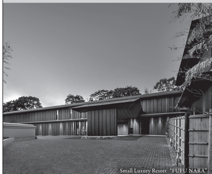
Small Luxury Resort "FUFU NARA"

Congratulations to the People of Romania!