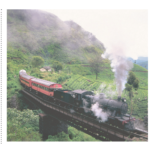
A tour of Sri Lanka aboard the Viceroy Special steam locomotive is a great way to see the countryside.

This content was compiled in collaboration with the embassy. The views expressed here do not necessarily reflect those of the