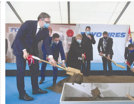
President Aleksandar Vucic participates in the groundbreaking ceremony for the construction of a Toyo Tire Corp. factory in Indija on Dec. 15, 2020.

As president of the Japan-Serbia Parliamentary Friendship League, I will do my utmost to further develop relations between our countries. Again, I offer my warm congratulations on the occasion of the Serbian National Day.