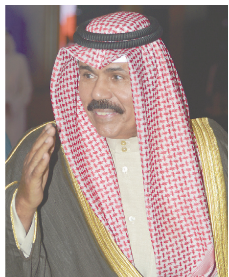
His Highness Sheikh Nawaf Al-Ahmad Al-Jaber Al-Sabah, amir of the State of Kuwait EMBASSY OF KUWAIT

This content was compiled in collaboration with the embassy. The views expressed here do not necessarily reflect those of the newspaper.