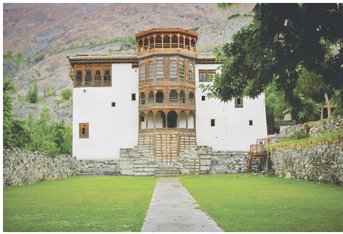
Khaplu Palace, a fort in eastern Gilgit-Baltistan MAHNOOR SAGHIR