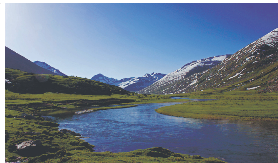
Mulla Ki Basti, a popular place to camp in the northern Mansehra District FAKHR ALAM

This content was compiled in collaboration with the embassy. The views expressed here do not necessarily reflect those of the newspaper.