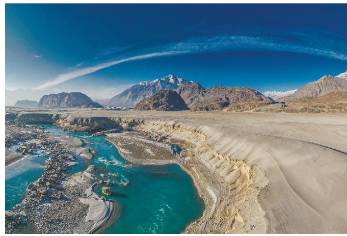
The Indus River near Skardu in Gilgit-Baltistan QAMMER WAZIR