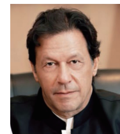
Prime Minister of Pakistan Imran Khan

THIS DAY WE CELEBRATE THE ANNIVERSARY OF OUR NATIONAL DAY