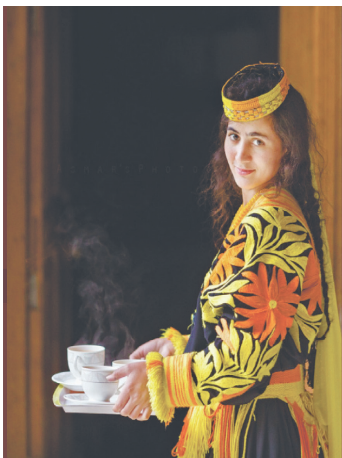
A Pakistani woman from the Gilgit-Baltistan region wears a traditional dress.

I conclude by once again offering my congratulations on Pakistan Day, as well as my sincere wishes for Pakistan's increasing development and prosperity in the future.